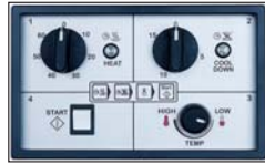
Mechanical timer (ME) Two timers : one for the drying time and one for the cooldown. Temperature switch : enables a simple temperature setting.