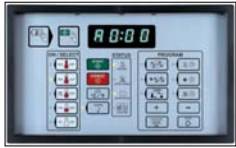
Microprocessor control (MI) easy to control programmer with humidity control which offers a wide range of possibilities

The machines are standard equipped with a simple, easy-to-control electronic programmer(MI) with dryness level setting which offers a wide range of possibilities . The tumble dryers are also available with a mechanical timer(ME) .